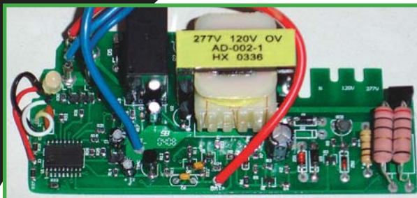
Optional self-diagnostic/self-test feature offers the ultimate in worry-free maintenance and reliability.