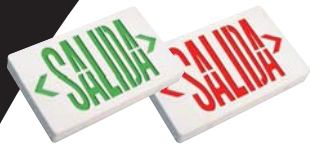
SALIDA faceplates also available.

Optional self-diagnostic/self-test feature offers the ultimate in worry-free maintenance and reliability.